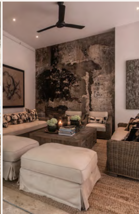
NO. 77 LEYN BAAN

From beautiful beaches, to breathtaking mountains and cultural marvels – The One Group of Hotels explores the natural diversity of Sri Lanka and aims to deliver the island's most luxurious standards of hospitality and adventure.